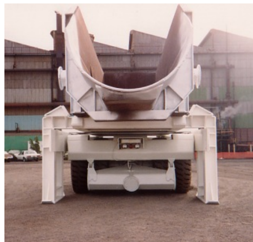
EP-500C with B.O.F. Scrap charging box.