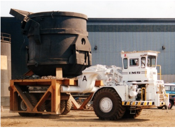
EP-180C with B.O.F. Scrap charging box.