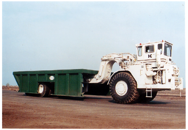
EP-200C with pallet for flat products.