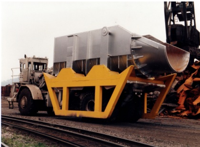
EP-180C With B.O.F. Scrap charging box