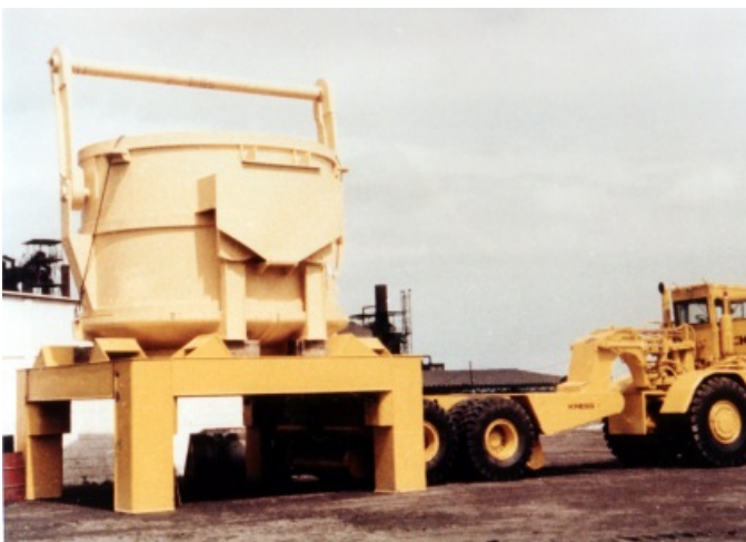
EP-300C with E.A.F. Scrap bucket.