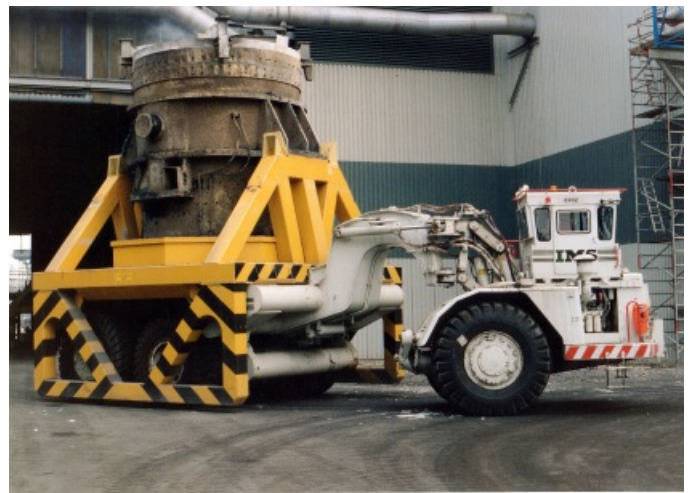
EP-660C with steel ladle.